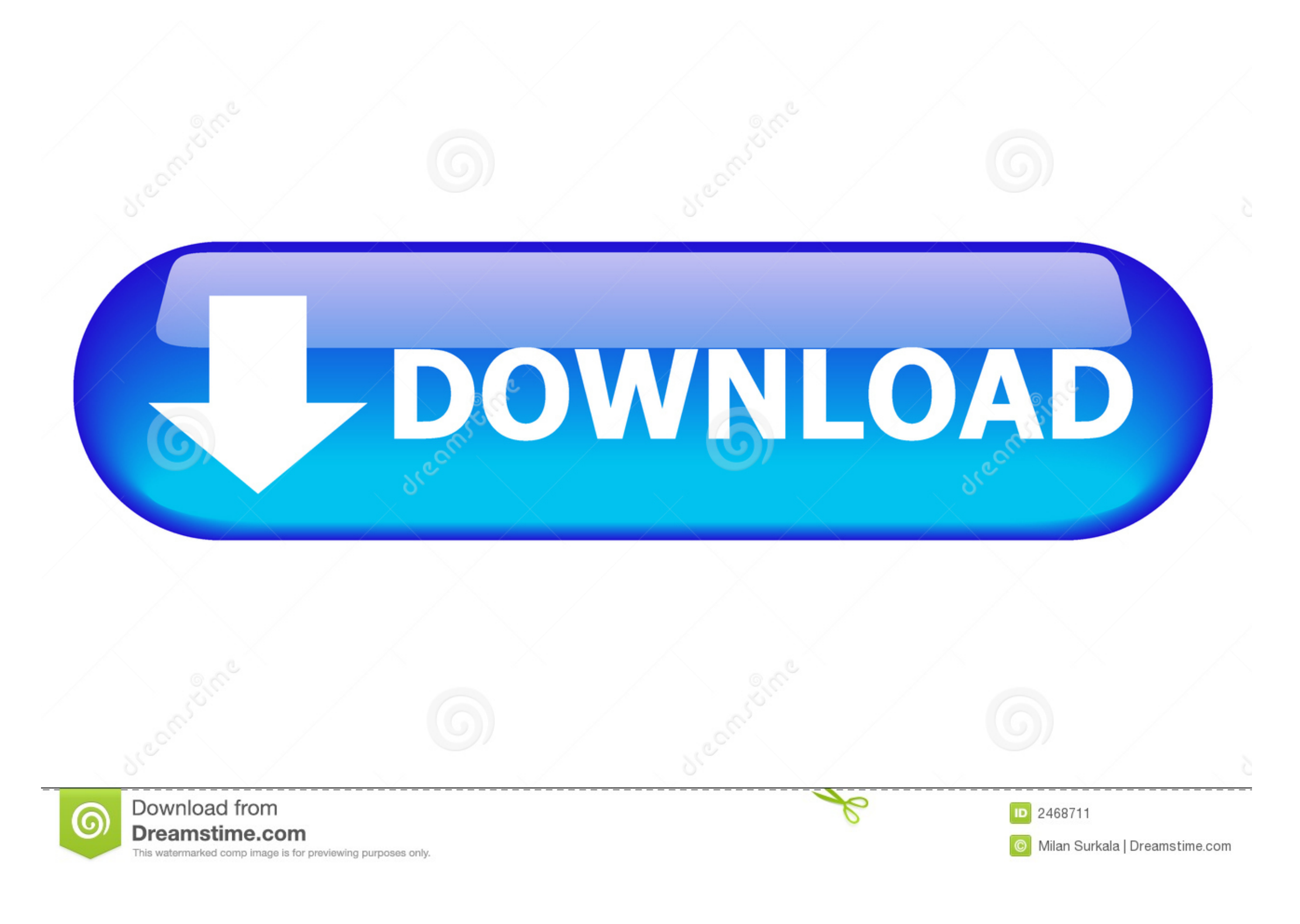
Doulci Activator V2 3 With Key